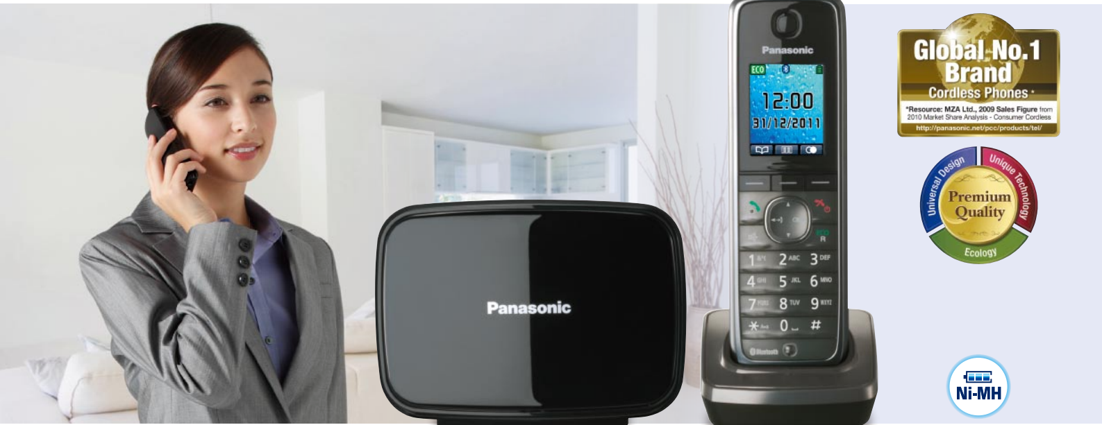
Metallic Gray Photo: Europe Model